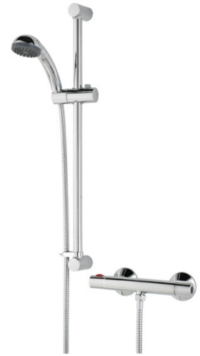
ZI SHXSMCT C shown above