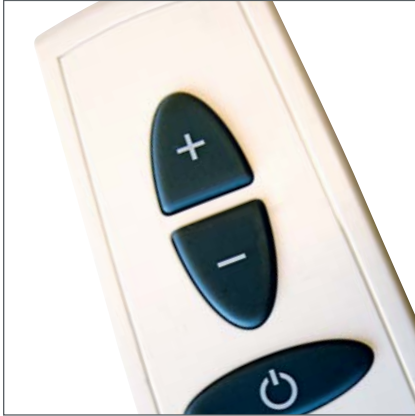
Remote control supplied.