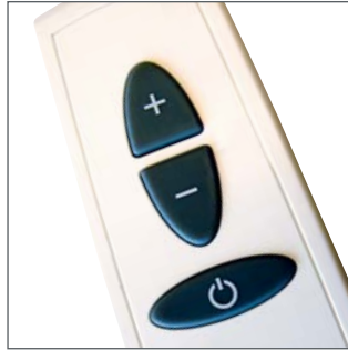
Remote control supplied.