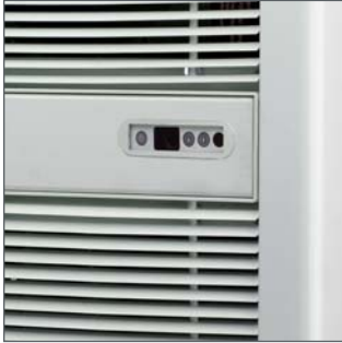
SLIM-LINE RC control panel.