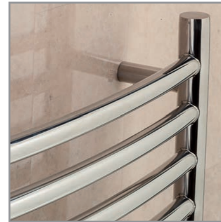
LANARK Curved option.