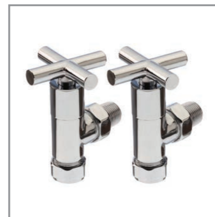
LIVINGSTONE Valves from £43.20 (pg 62).