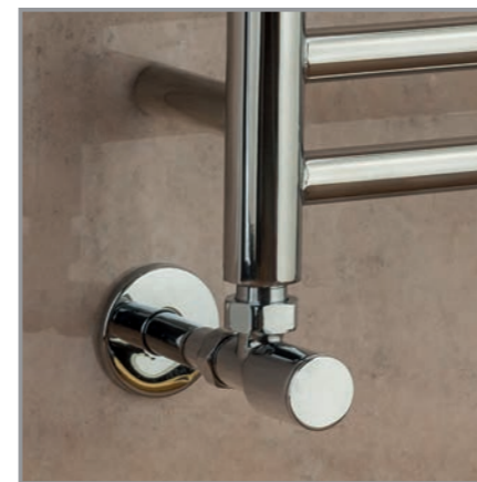
DRAKE Valves from £36.00 (pg 62).