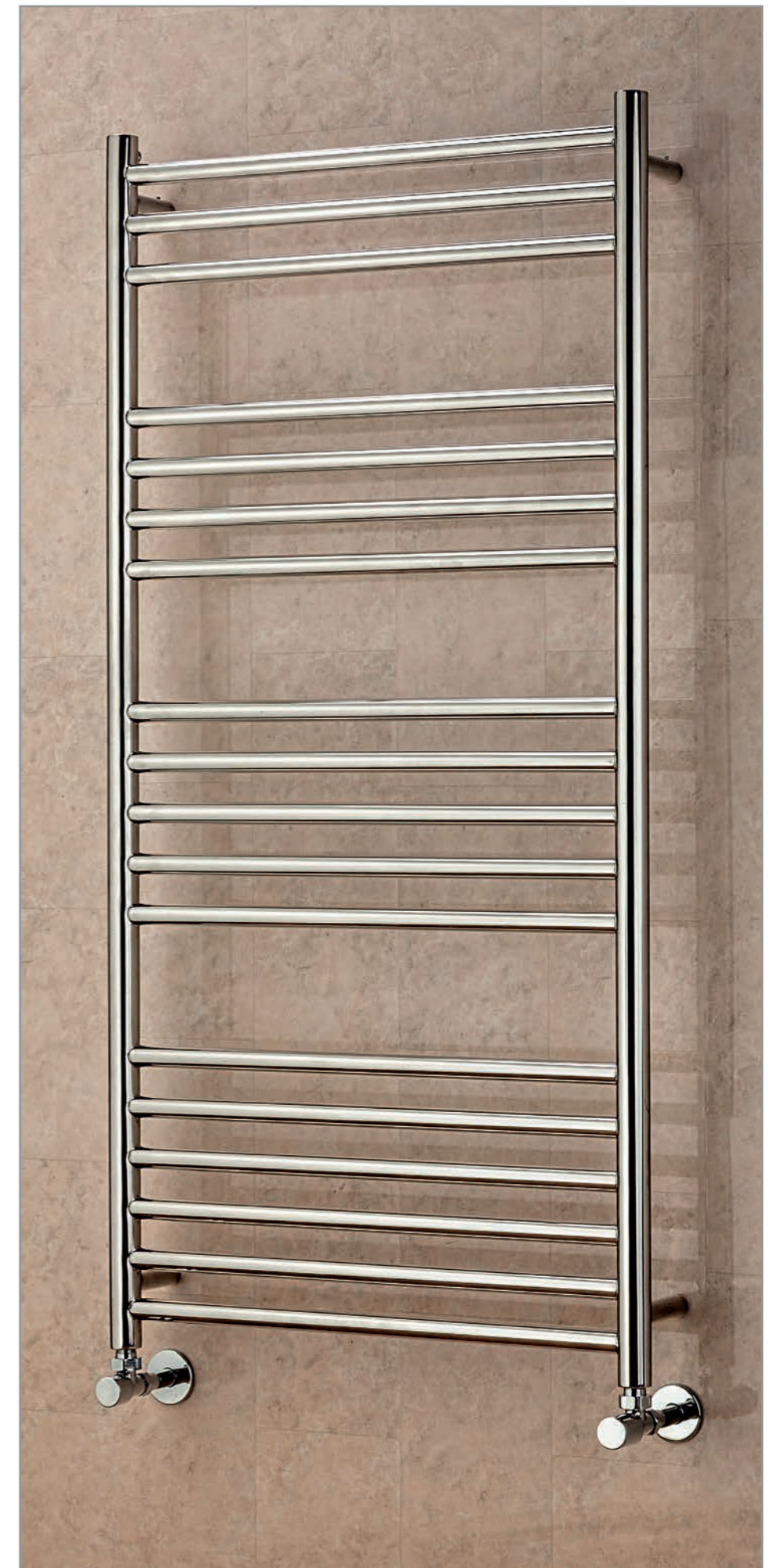
◆LANARK Straight 1200mm x 500mm shown with DRAKE Valves.