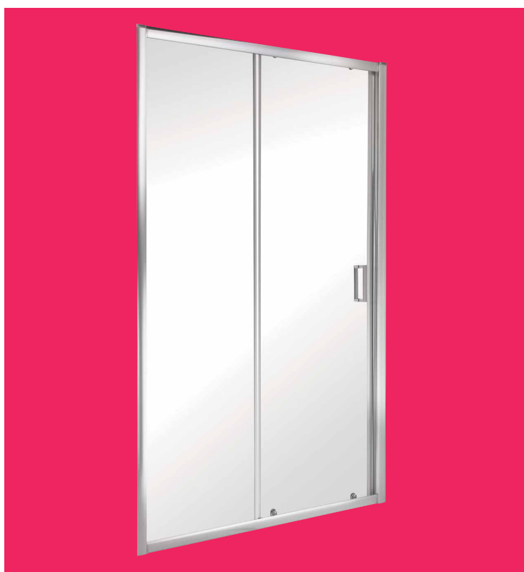
ES200 sliding door

6mm toughened safety glass click lock mechanism for quick assembly of horizontal profiles